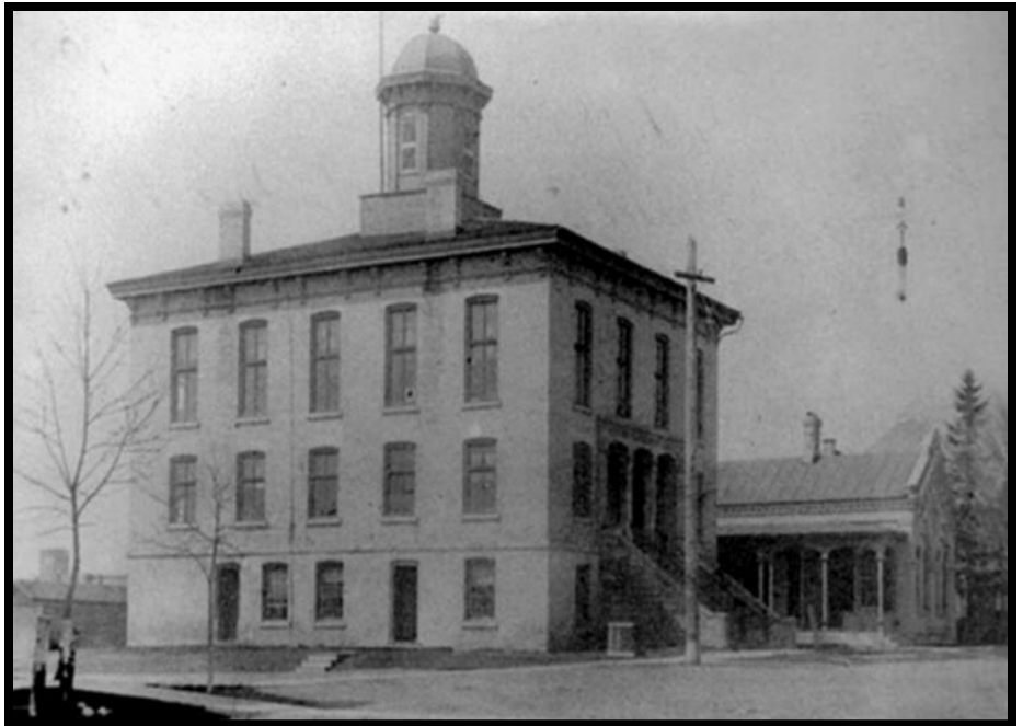
Ozaukee County Courthouse

Once Governor Salomon was informed of the situation, he issued orders. "I hereby authorize you to proceed immediately to Port Washington, with a sufficient military force to enforce the draft, and arrest the leaders and aides and abettors in the riotous proceedings