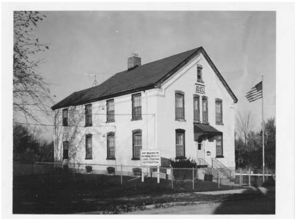
The structure as it appeared in 2001

The restoration project, as approved by the National Park Service and the Wisconsin State Historical Society, encompassed cleaning and repairing the exterior masonry and rebuilding the infrastructure, walls, roof, tower and lantern room. The exterior bears the scars of a 1934 renovation, but the dwelling once again stands as a complete Light Station.