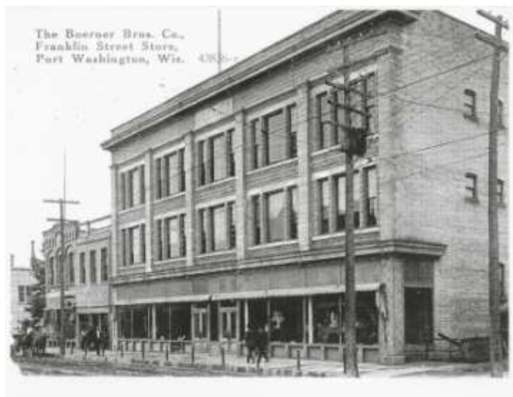
Boerner Bros. Co on Franklin Street.

Consider being a part of the Resource Center on Grand Ave. We are open Monday and Thursday afternoons. We are in need of volunteers to file, to work with Pastperfect , and to help with the storage and organization of do-