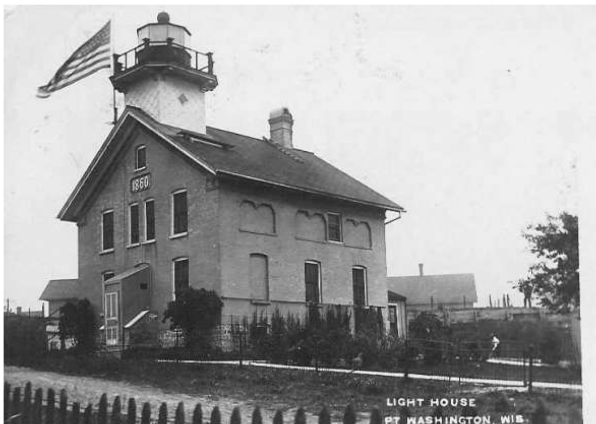
Light Station as it appeared in 1908— The Light Station beacon was discontinued October 31, 1903 and the last light keeper was replaced in 1924 when the pier head light was automated.

By 1859 the lighthouse had to be replaced, possibly due to poor mortar or substandard bricks. This was the case at many sites around Lake Michigan, although a definite citation regarding the reason for demolishing the 1849 lighthouse is not known. The 1860 Light Station with living quarters was considered a rebuilding by the Coast Guard. Brick was salvaged and reused in the new construction .