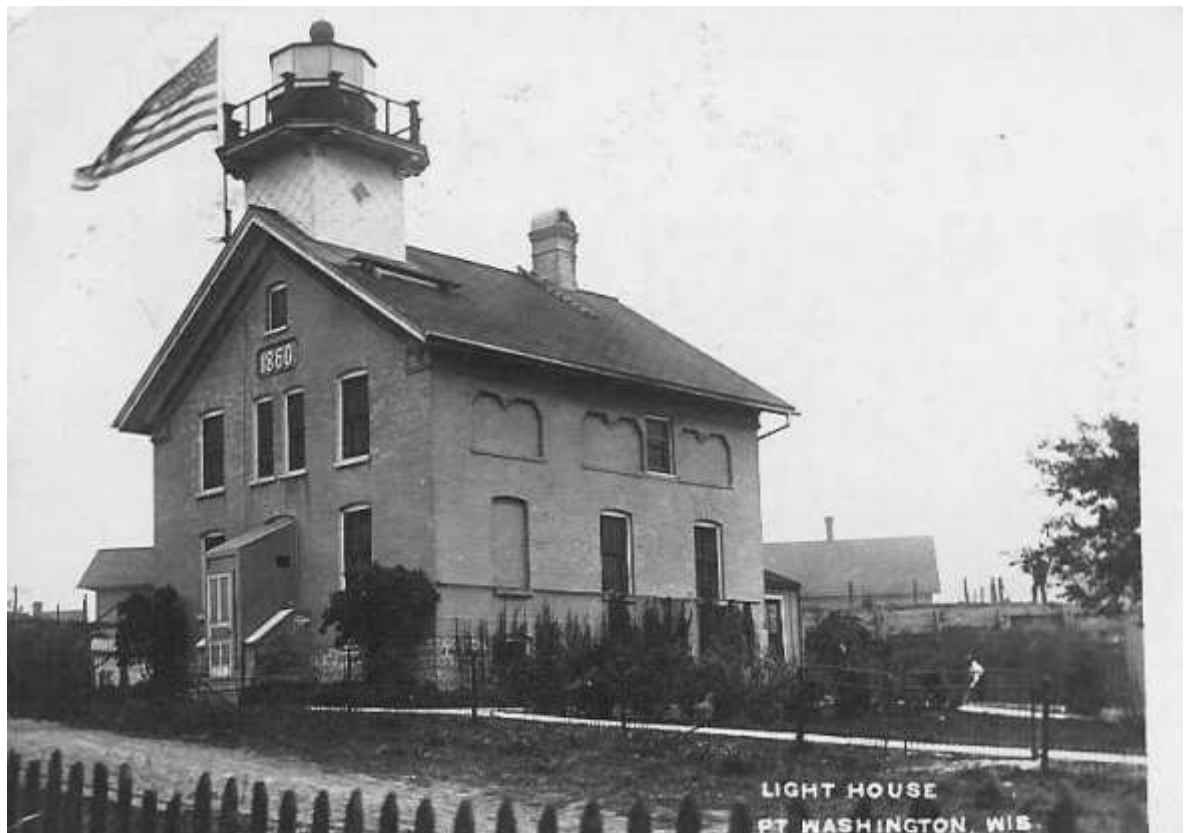
Light Station as it appeared in 1908— The Light Station beacon was discontinued October 31, 1903 and the last light keeper was replaced in 1924 when the pier head light was automated.

By 1859 the lighthouse had to be replaced, possibly due to poor mortar or substandard bricks. This was the case at many sites around Lake Michigan, although a definite citation regarding the reason for demolishing the 1849 lighthouse is not known. The 1860 Light Station with living quarters was considered a rebuilding by the Coast Guard. Brick was salvaged and reused in the new construction .