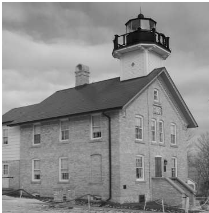
The beautifully renovated Light Station as it appears today

The first floor was completely gutted and rebuilt to the original specifications. The second floor rental unit was completely remodeled. A new access ladder for the tower and lamphouse, as well as a restored landing for the stairway from the first floor was added in anticipation of visitors and tours.