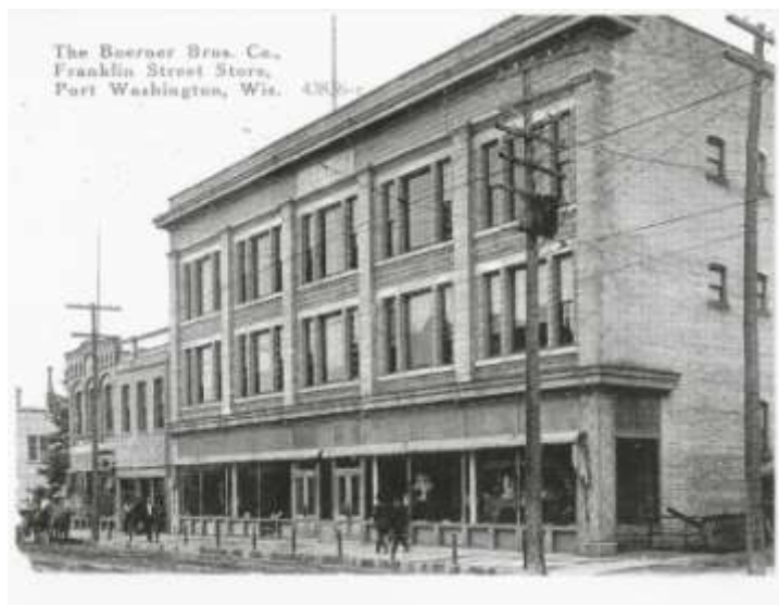
Boerner Bros. Co on Franklin Street.

Consider being a part of the Resource Center on Grand Ave. We are open Monday and Thursday afternoons. We are in need of volunteers to file, to work with Pastperfect , and to help with the storage and organization of do-