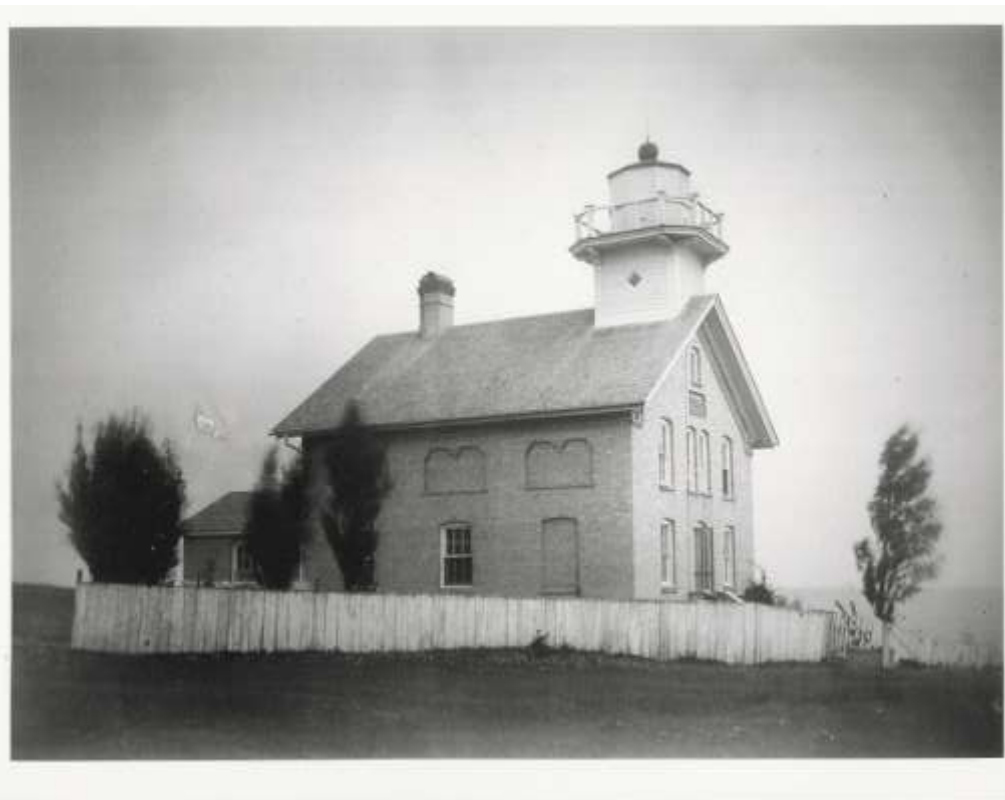
The Light Station as it appeared in in the late 19th Century

Port Washington's first lighthouse was built on purchased land, in 1849. The lighthouse rose 36-38 feet from the ground to the lantern. Lighthouse and keeper's dwelling were constructed of cream city brick and were some distance from the lighthouse, probably right where the current light station is situated.