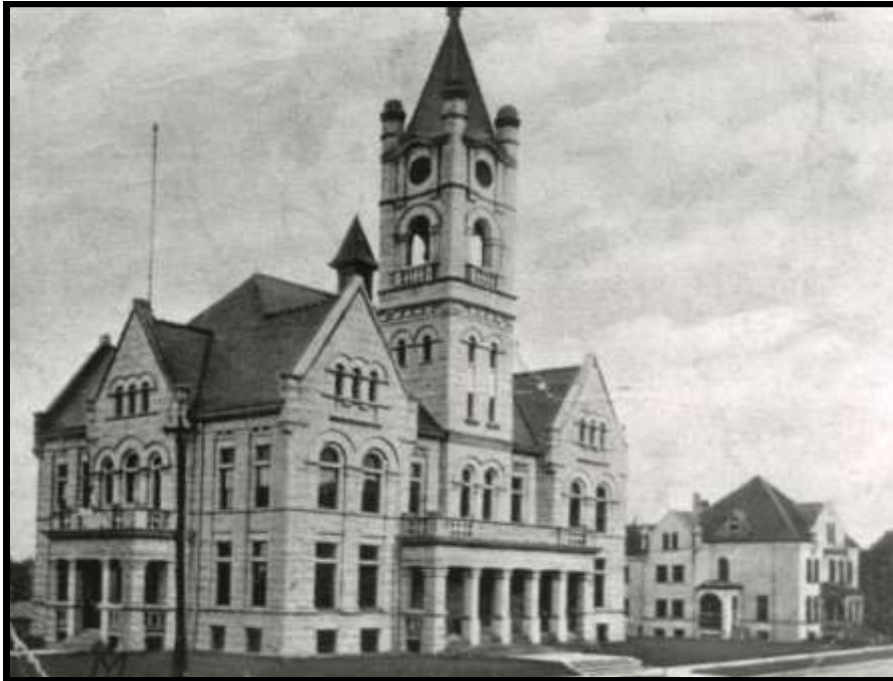
Ozaukee County Jail as it appeared in the early 1900's (to the right of the court house).

first and only building funded by the county government prior to the 1853 division of Washington County to form Ozaukee County. Prior to this jail, prisoners were boarded in Milwaukee.