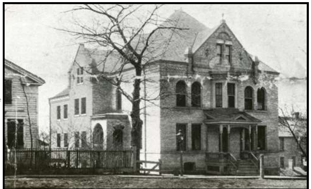
Ozaukee County Courthouse with jail in 1907

The first county jail offered 1 bed, 1 heating stove and 3 windows. In 1852 talks began to build a new jail, and the sites of Newburg or Trenton were discussed. With the division of the county into two, Port Washington became the home to a newly expanded 24 x 30 foot Ozaukee County Jail that was still standing in 1945