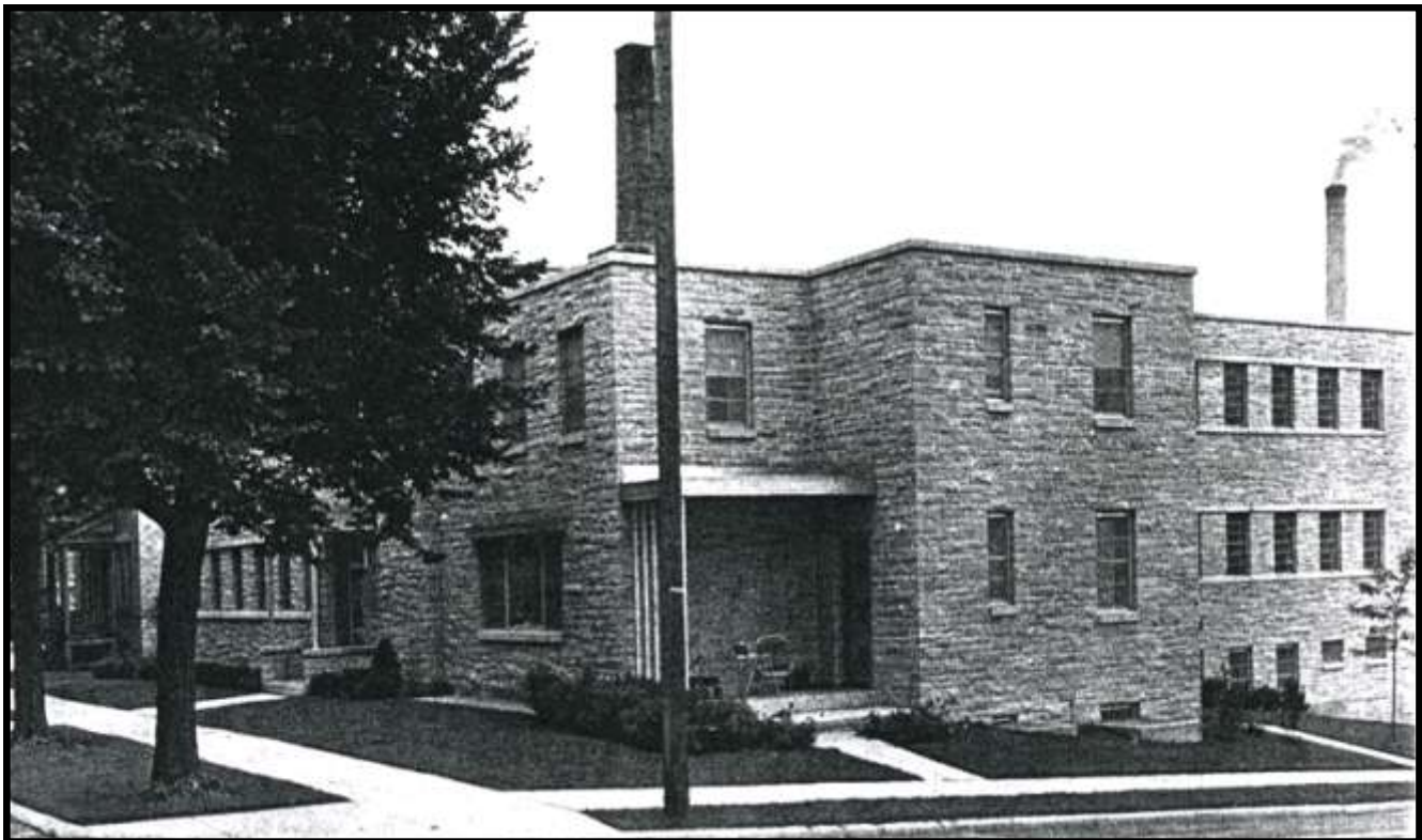
Ozaukee County jail with Sheriff's residence around 1959