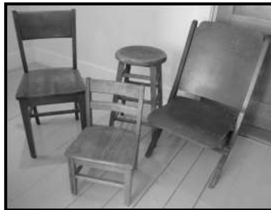
Some chairs made by the Wisconsin Chair Company

If bringing a chair entry with registration, call the office first. Chairs will be displayed in downtown merchant windows until August 14th. The kick off for the chair displays is March 21 during the "Hot in the Harbor" event, but you have until July 18th to overhaul your ye olde seat and enter the ye olde contest.