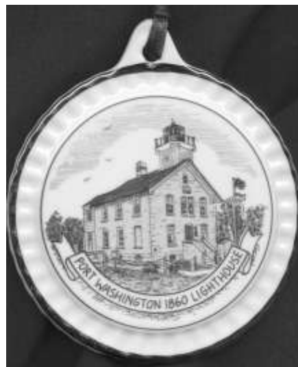
Ornament (with text on back) $10.50

New Porcelain Light House Magnet and Ornament