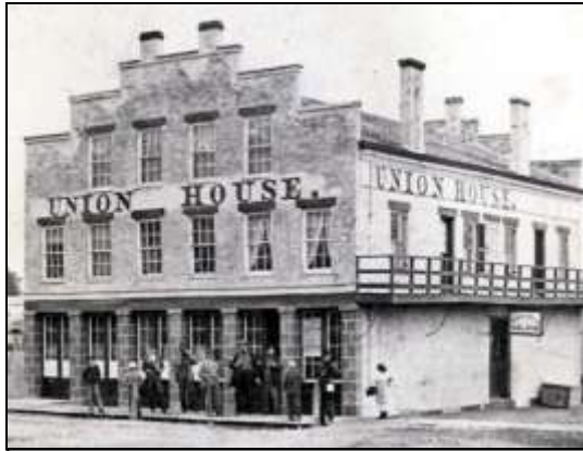
Union House in the 19th Century—now the Wilson House

The businesses that served the public alcoholic beverages have been known by various names over the years. In many cases, names changed but locations remained the same since the late 1800's while others were replaced