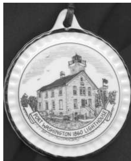
Ornament (with text on back) $10.50

New Porcelain Light House Magnet and Ornament